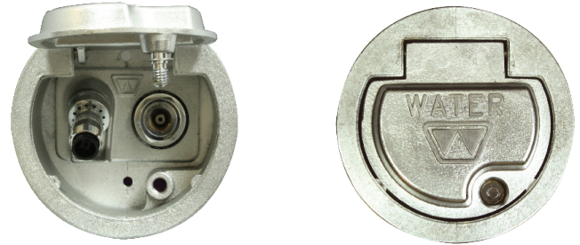
Exterior Finish: Box & Door - Chrome (CH) Only

The Model RB67 is an automatic draining, freezeless wall hydrant with hose connection Backflow Protection. The hydrant drains as handle is shut off, even if hose is attached . Designed especially for tip-up wall construction, the hydrant is housed in a round, tamper resistant silicon bronze box that can be installed through a 6" diameter core drilled hole. The Model RB67 is intended for irrigation purposes and designed to blend in with modern architecture for installation on restaurants, schools, office buildings, churches, apartments, motels, stores, shopping centers and industrial buildings.